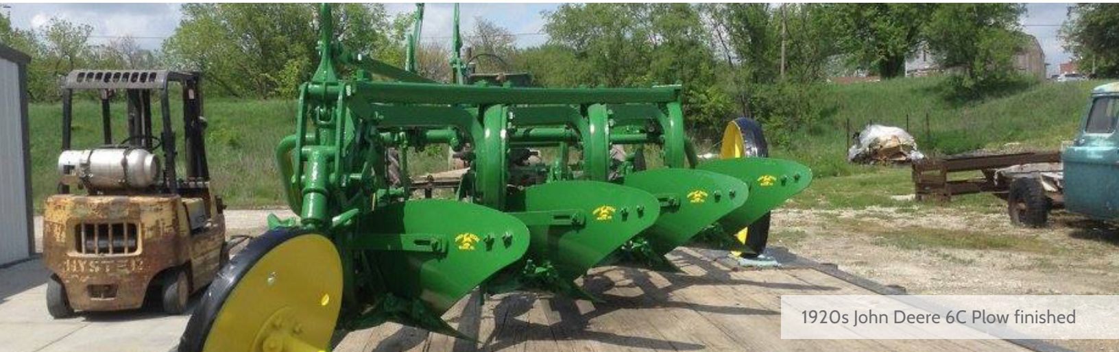
1920s John Deere 6C Plow finished