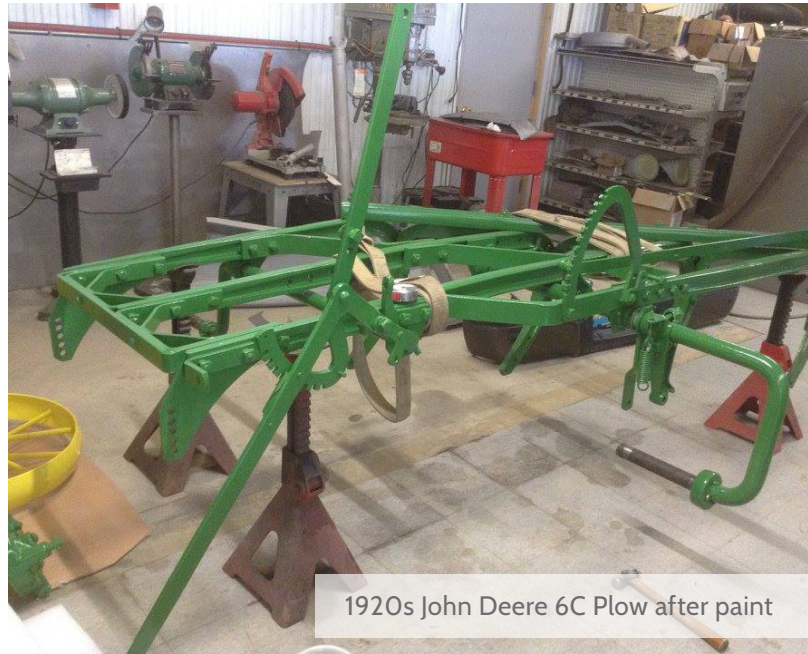
1920s John Deere 6C Plow after paint